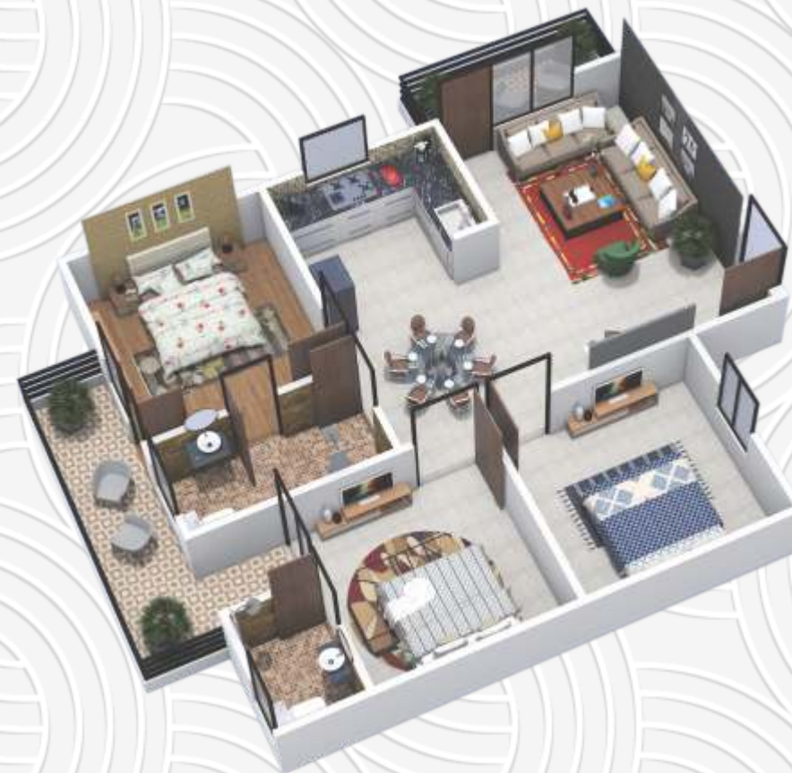
FLOOR PLAN TYPE - 2 - 3 BHK