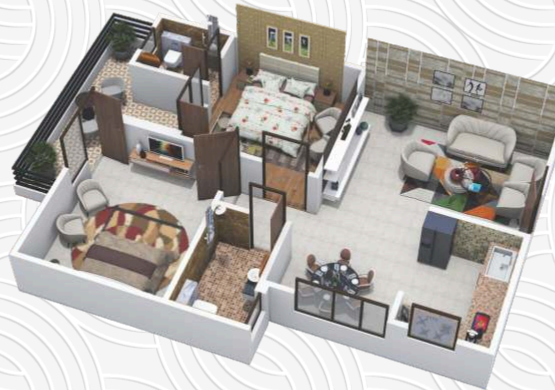
FLOOR PLAN TYPE - 4 - 2 BHK