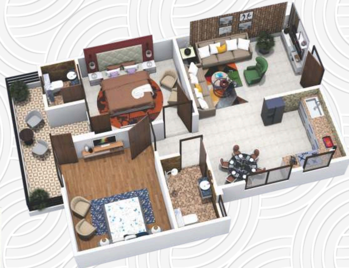
FLOOR PLAN TYPE - 3 - 2 BHK