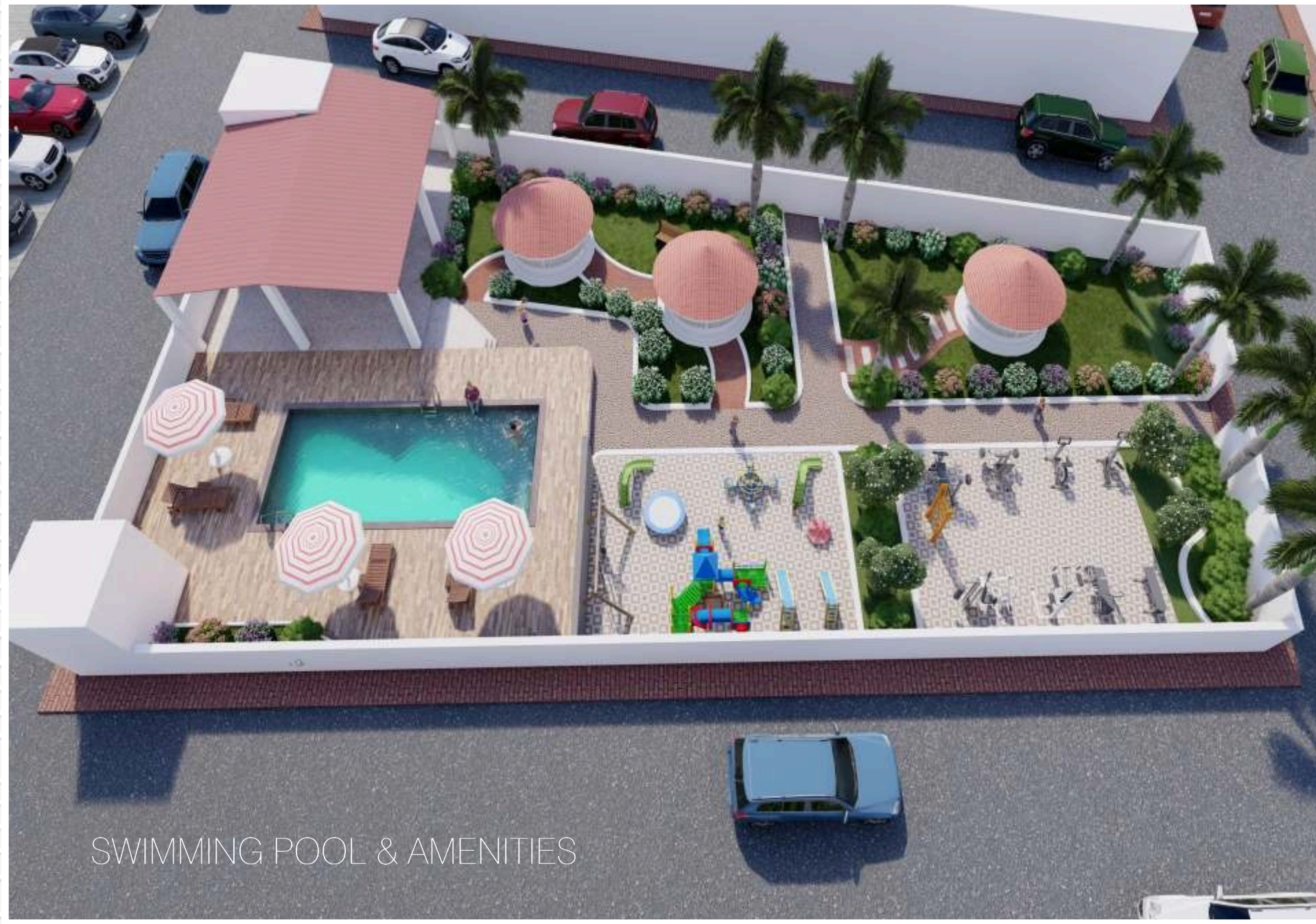
SWIMMING POOL & AMENITIES